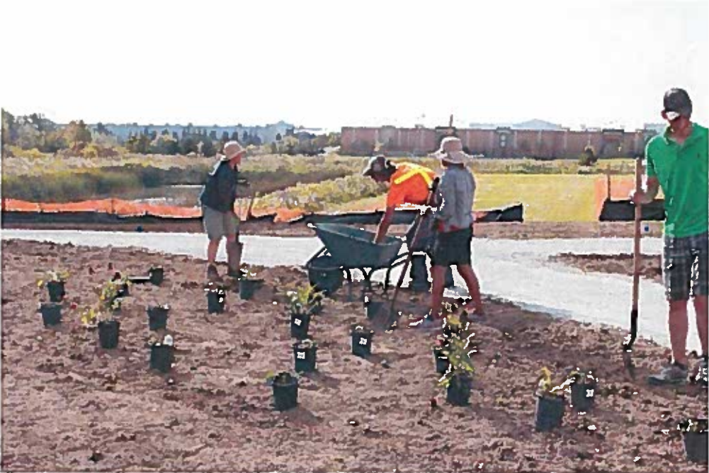
City of Oshawa formal garden